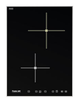
Table de cuisson Ognidove